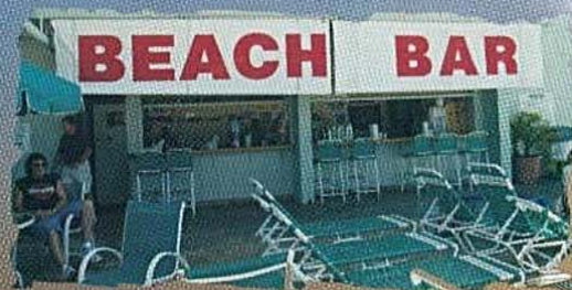
Pool Side Bar