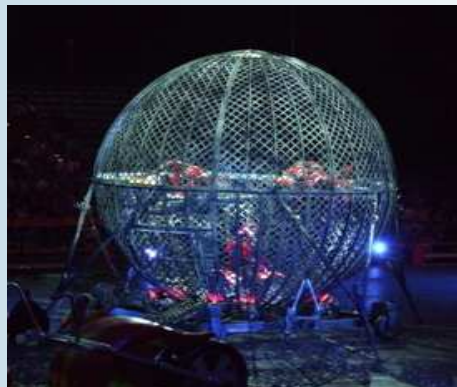
Here are some pictures from the Houston Show!